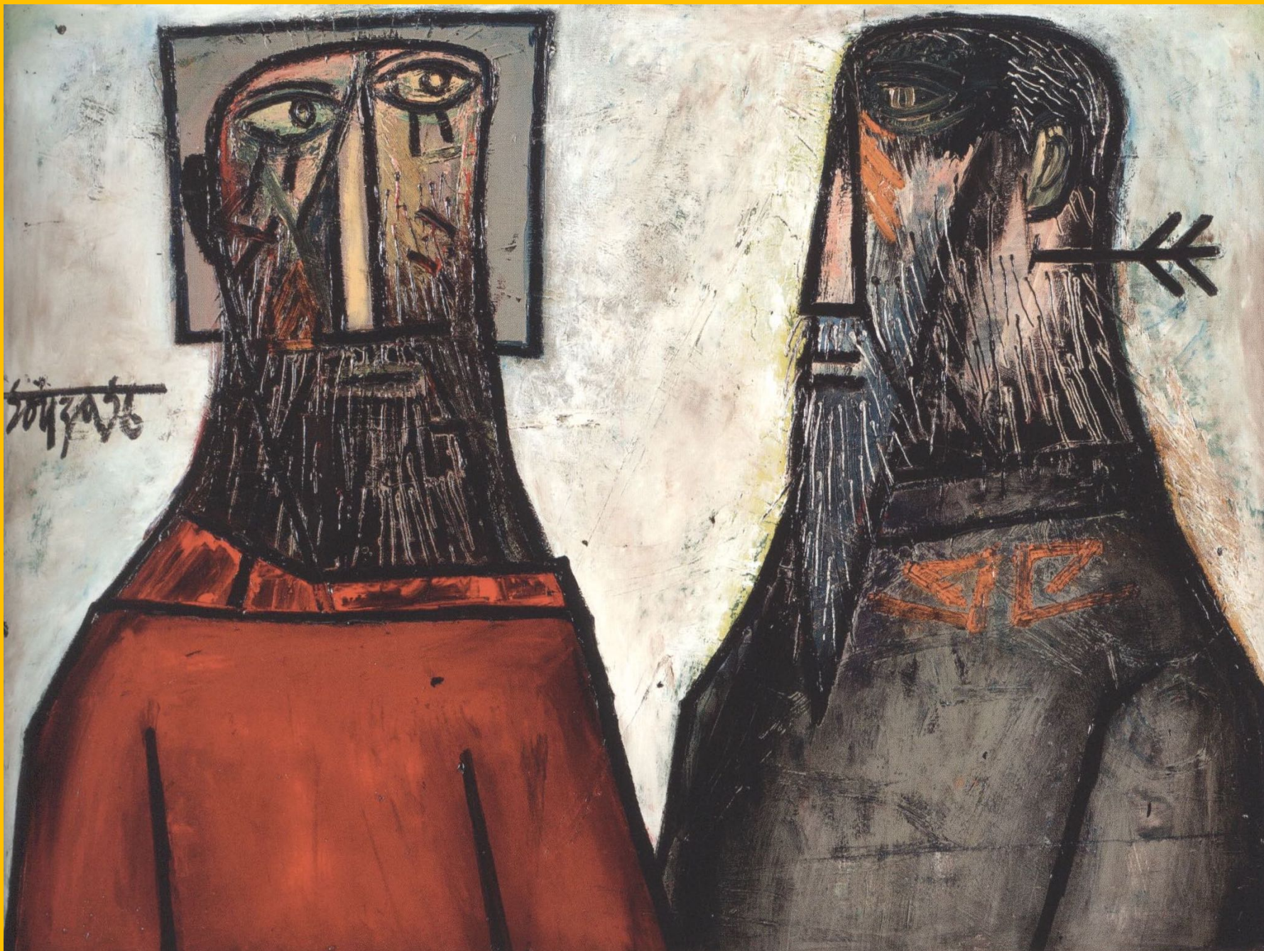
Jesus and Pilatus c. 1955-6 Francis Newton Souza