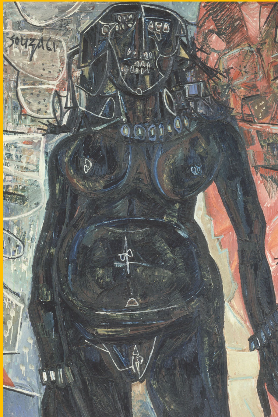
Black Nude 1961 Francis Newton Souza