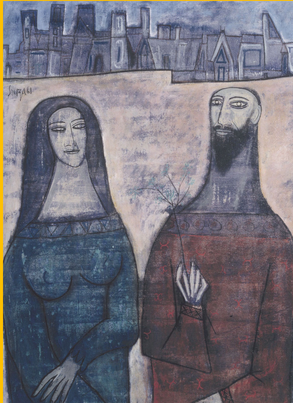
Two Saints in a Landscape 1961 Francis Newton Souza